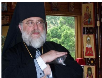
His Grace with one of the soon-to-be barn cats

Following the Divine Liturgy, at breakfast, the Bishop visited with us and had an opportunity to meet two of the kittens recently born at the monastery. They are about to become barn cats at a neighbor's farm, and we were pleased that they could receive the Bishop's blessing before commencing such dangerous careers.