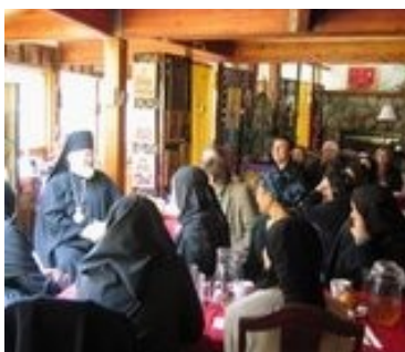
His Grace regales the community with one of his many stories