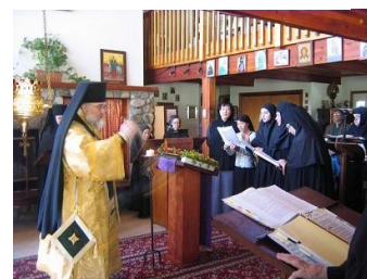
His Grace censuring during Liturgy